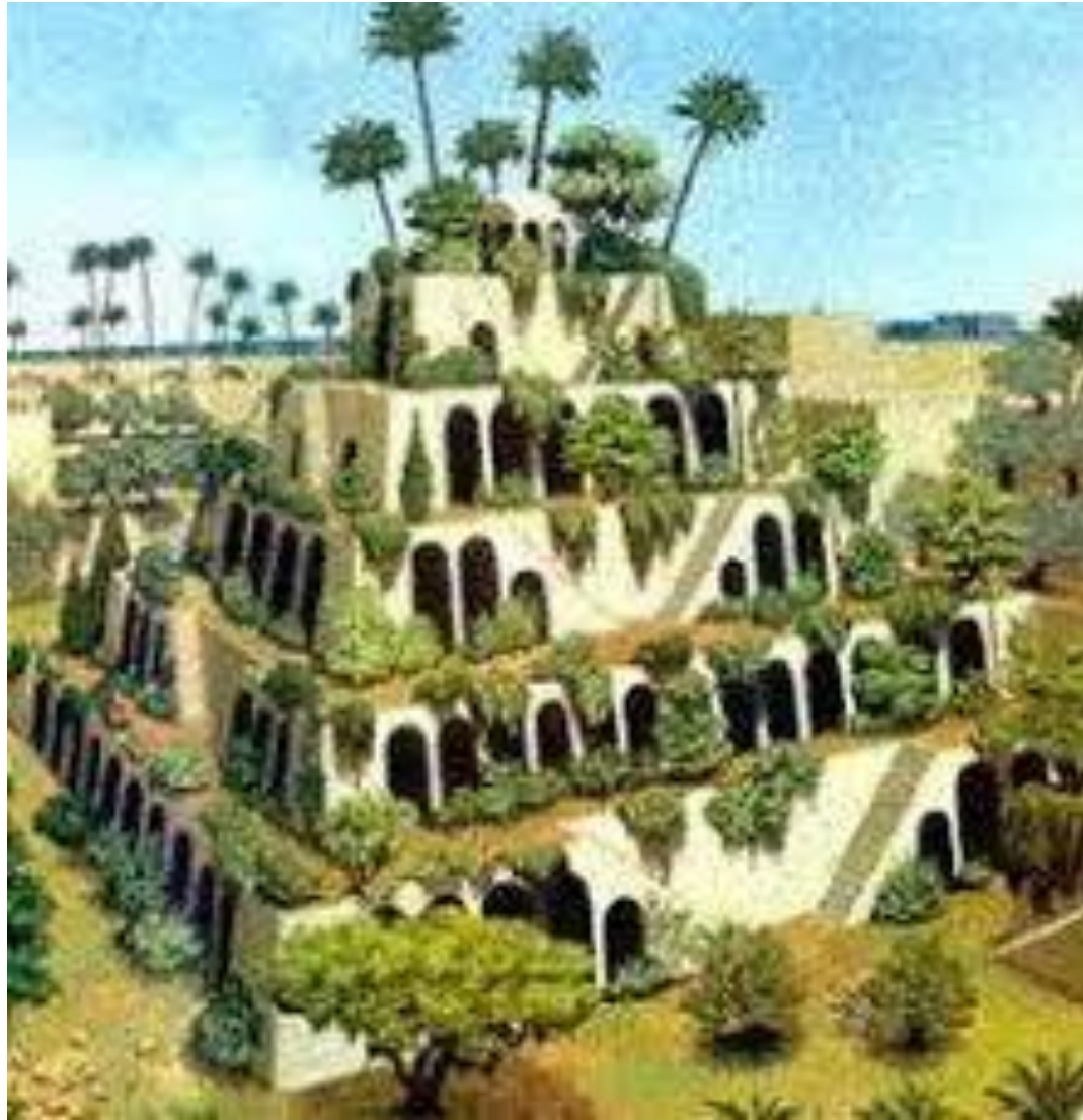
The Hanging Gardens of Babylon