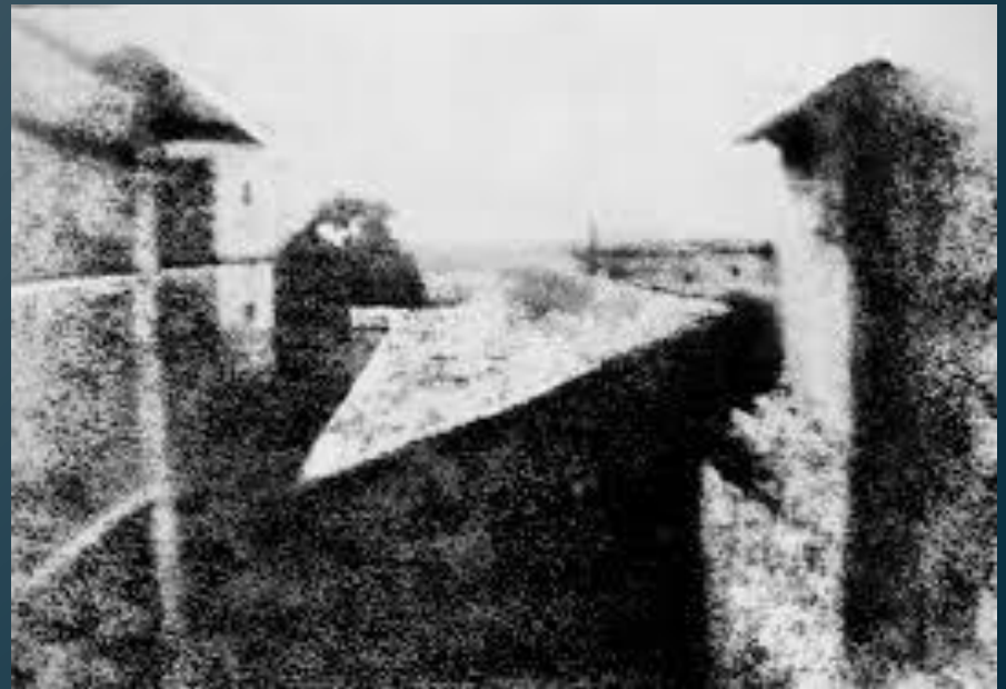
The first photo