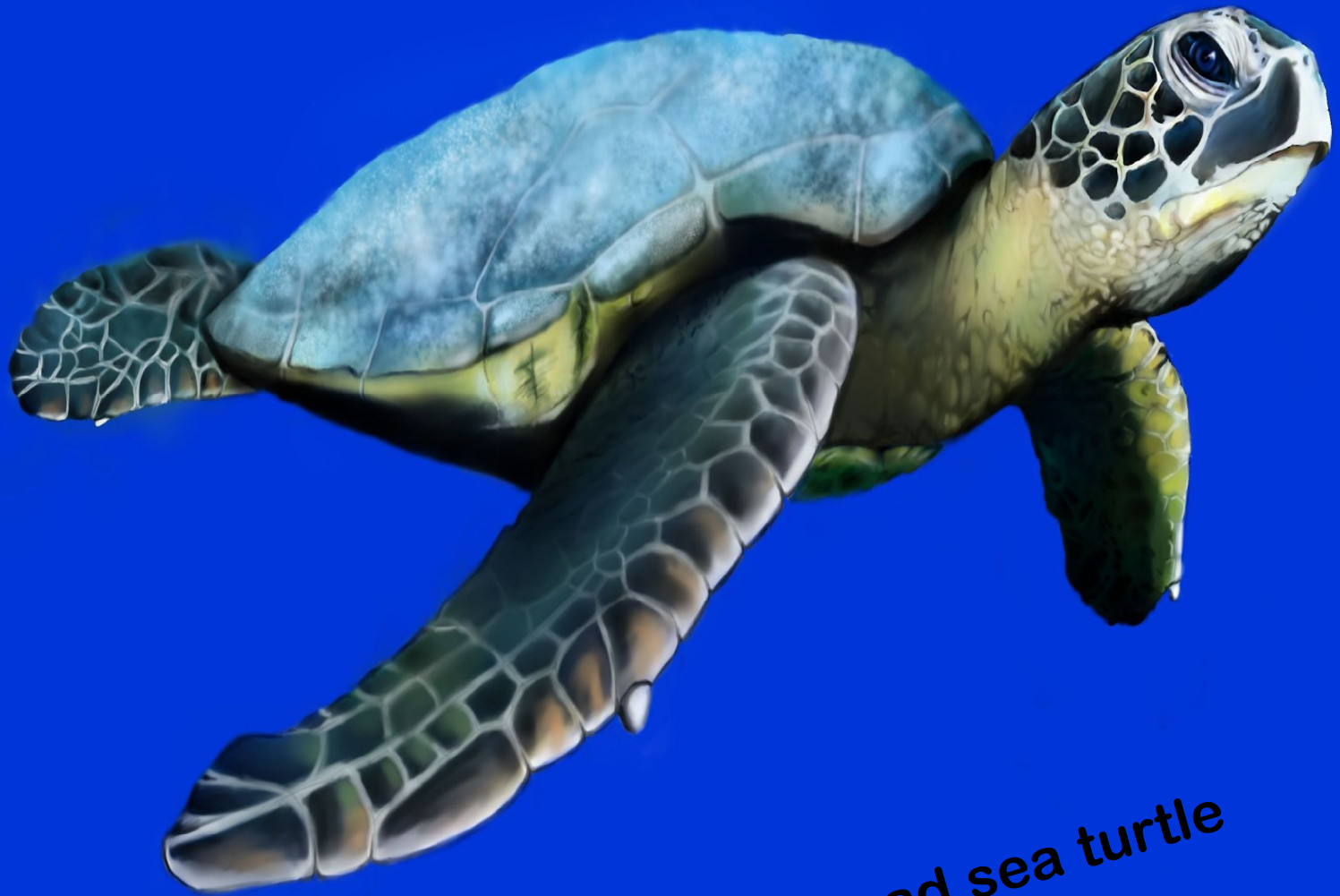
Loggerhead sea turtle