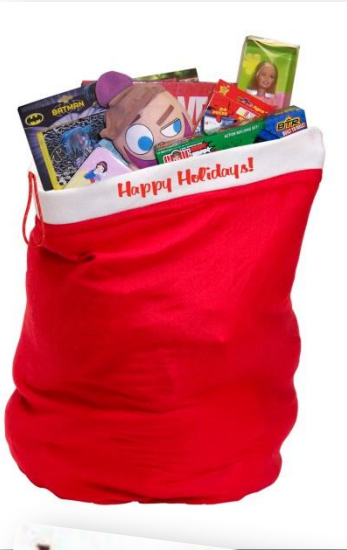
bag of toys