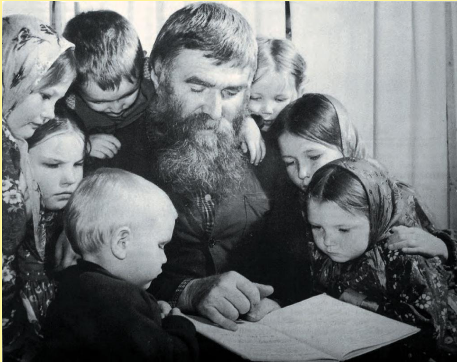
Russian orthodox "Old believers" in Brazil, 1967