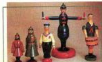
Painted Red Army soldiers

Sergiev Posad near Moscow is famous for its wooden toys. They still make toys there today, and they've got a great Toy Museum.