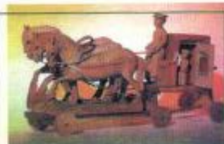
A beautiful wooden troika