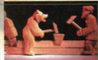
An original 'Trinity' toy