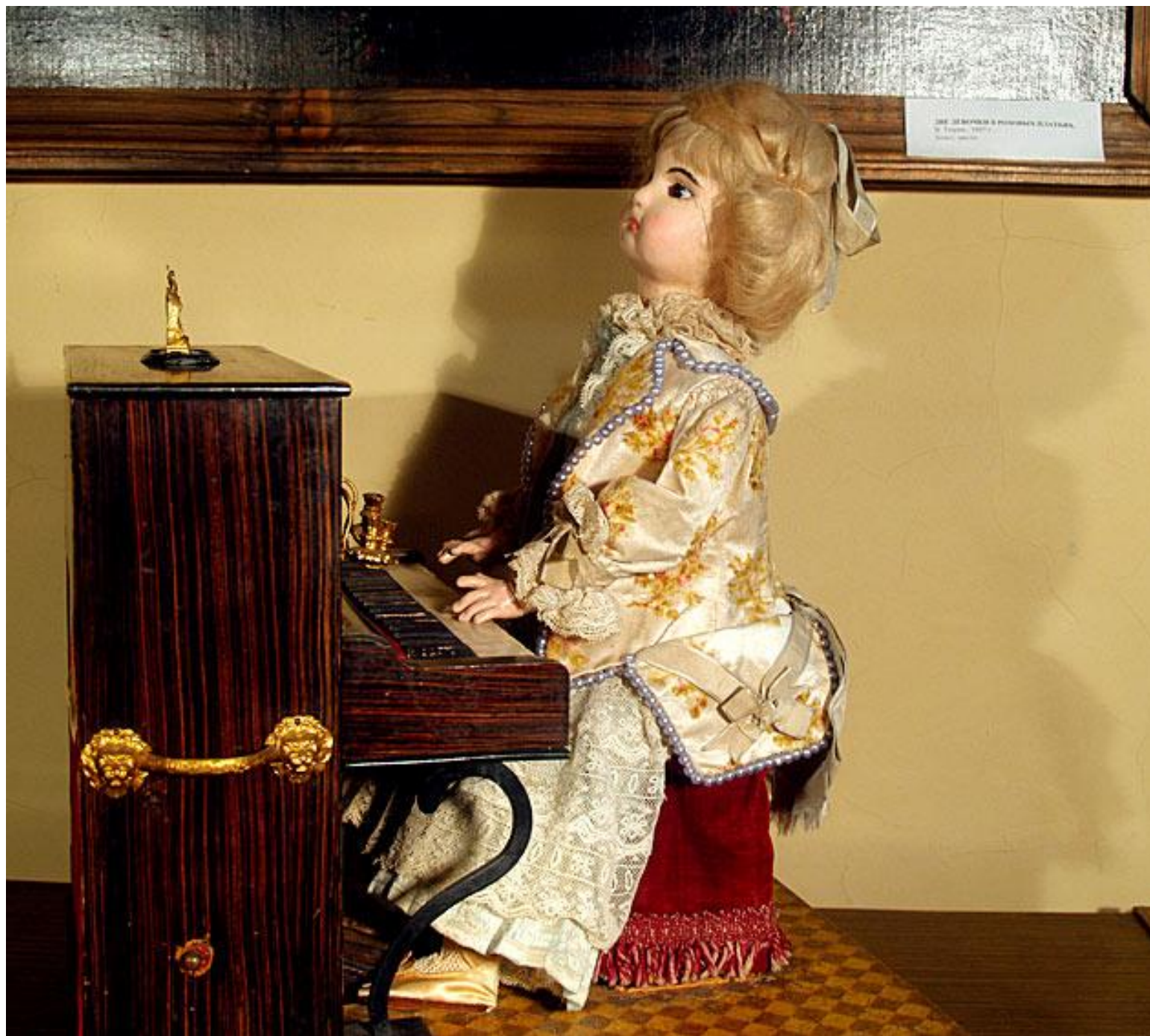
Долг. 22. Девочка в белом платье. 18. 1. 1880. 1880. 1880. 1880. Сделано в России.