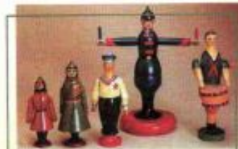
Painted Red Army soldiers

Sergiev Posad near Moscow is famous for its wooden toys. They still make toys there today, and they've got a great Toy Museum.