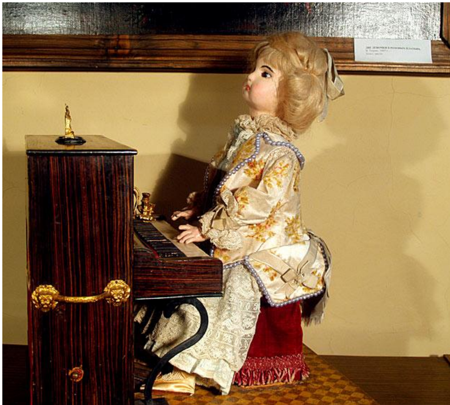
Долг. 22. Девочка в белом платье. В. Т. Ткачев. 1907 г. - Музей. Москва.