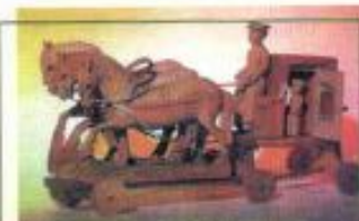
A beautiful wooden troika