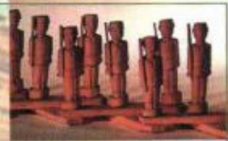
A set of toy soldiers