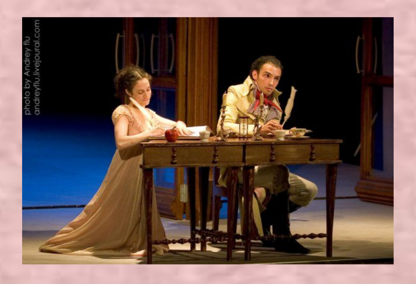
And the p. Lay starts