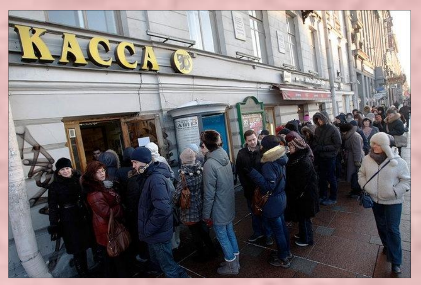
It's a q.u e.u e