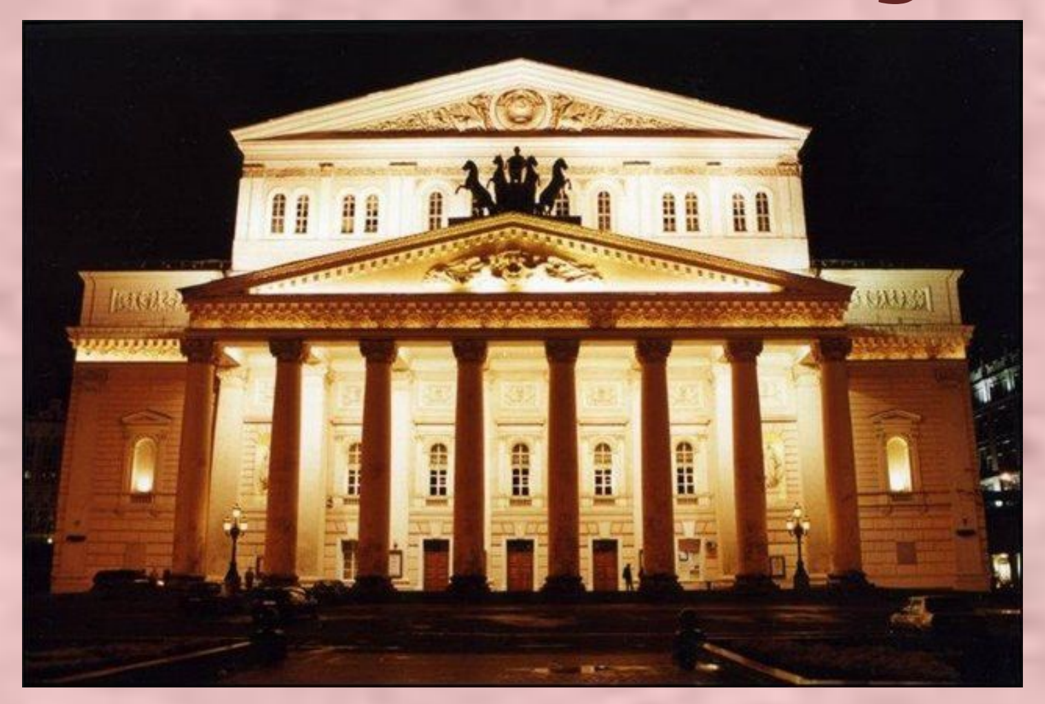
It's a theatre