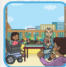
Make an Easter garden