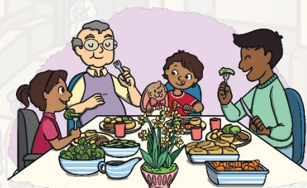
Eat a special dinner