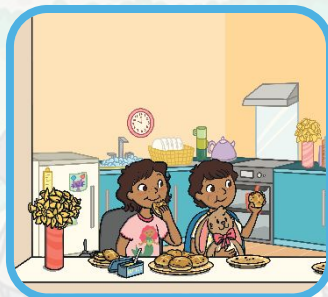
Eat hot cross buns