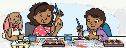
Decorate Easter eggs