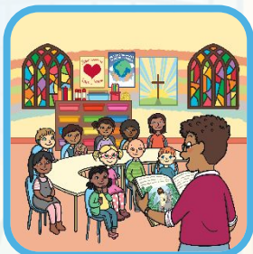
Read or listen to The Easter Story

There are many ways Christian people celebrate Easter. These are just a few Easter traditions .