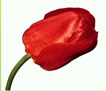
a. a red tulip