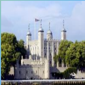
c. The Tower of London