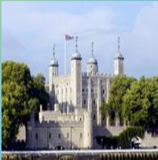
c. The Tower of London