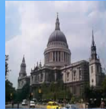
b. St. Paul's Cathedral