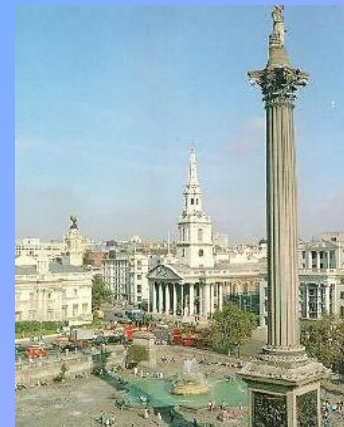
d. Trafalgar Square