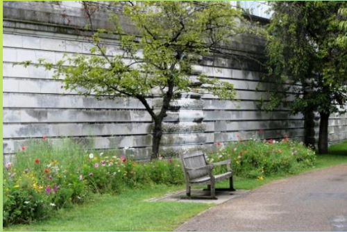
a. St. James's Park