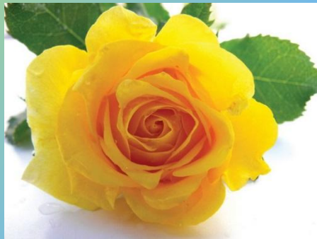
c. a yellow rose