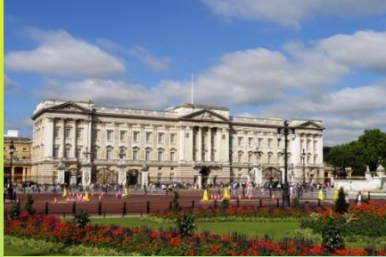
a. Buckingham Palace