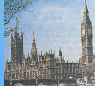
b. The Houses of Parliament