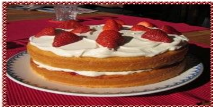
The Victoria Sponge Named after Queen Victoria

Although many foreigners find British food disgusting, British teenagers in the survey enjoy eating bacon sandwiches, baked beans, cheddar cheese and curry (well, it's not British but it is one of Britain's most popular foods). Also, we know it's a British stereotype but many British teenagers still like drinking a nice cup of tea in the morning.