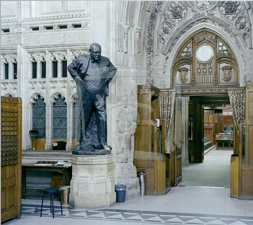
P010-2619 Интерьер здания Британского Парламента (Houses of Parliament), 2002. На фото - холл палаты общин (House of Commons lobby).