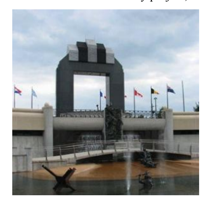
The National D-Day Memorial in Bedford, Virginia.

Sixty miles south of the National Mall in Washington, D.C., is a small marker that pays homage to Union Troops who fought in the battle of Fredericksburg during the Civil War. Across our nation, memorials and markers can be found that honor the brave men and women who have served our nation. From the Revolutionary War to our present conflict, these memorials range in size and scope from large monuments that represent a state's Veterans to small plaques that may recognize only a few individuals from a small town. These memorials are not intended to glorify war, but to ensure that we remember the sacrifice by those men and women who have offered and given their life to ensure our freedom and liberties. For a Veterans Day project, students may research local Veterans' memorials.