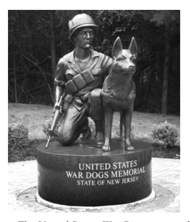
The United States War Dog memorial in Holmdel, New Jersey 7