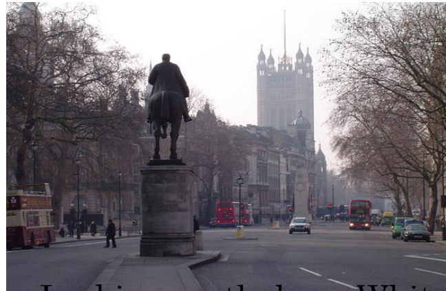
Looking south down Whitehall towards Victoria Tower of the Palace of Westminster