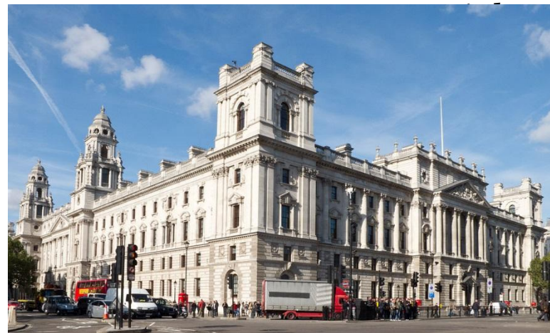
Government Offices Great George Street, Parliament Street