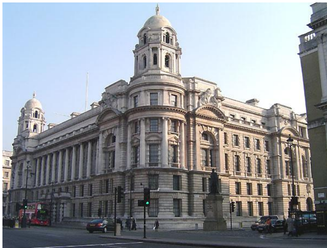
Old War Office