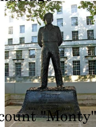
Viscount "Monty" of Alamein