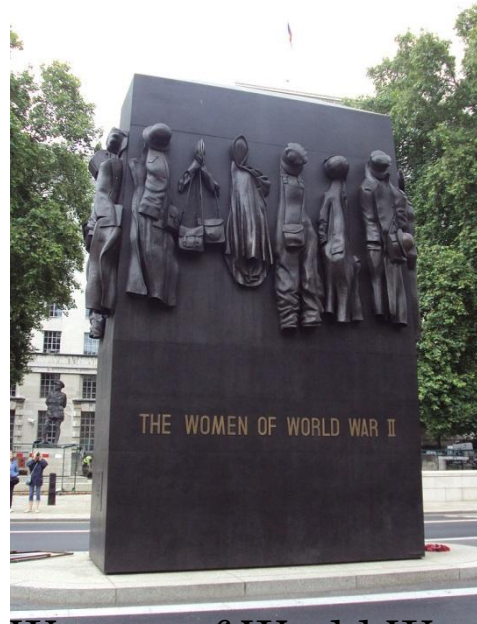
Women of World War II