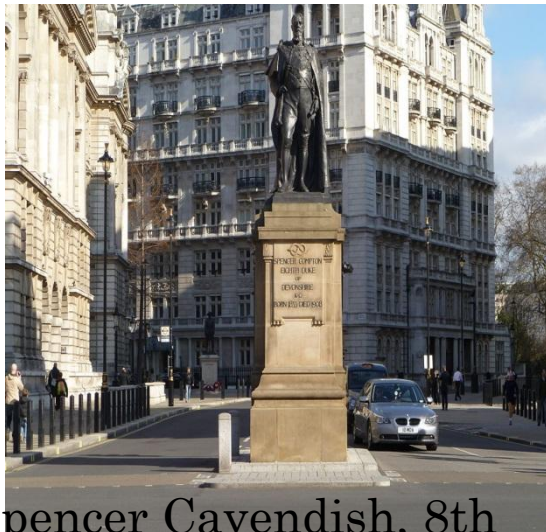
Spencer Cavendish, 8th Duke of Devonshire