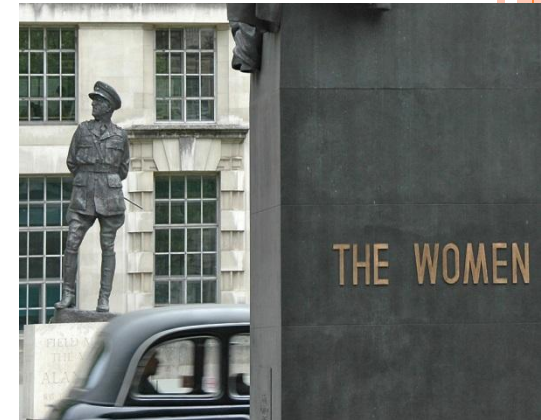
A taxi passing between two of Whitehall's famous