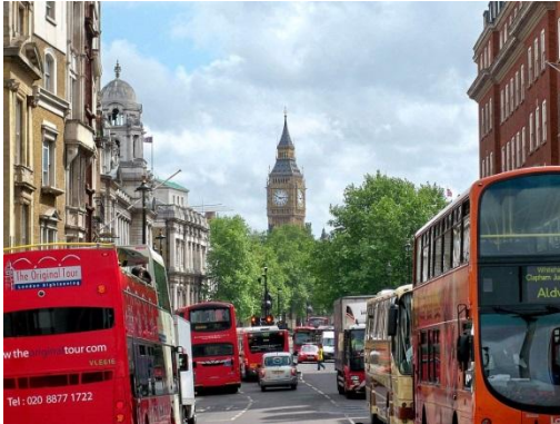
Busy street traffic on Whitehall, pictured from Trafalgar Square