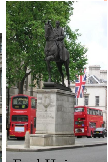
Earl Haig Memorial